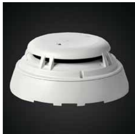
I.S. SMOKE AND HEAT DETECTION