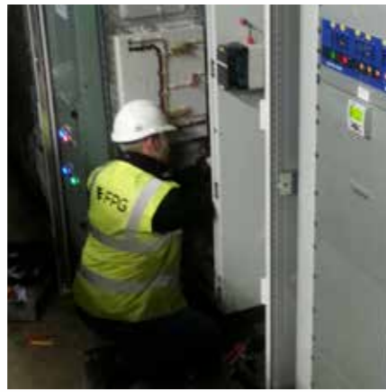
OFFSHORE SERVICING AND MAINTENANCE