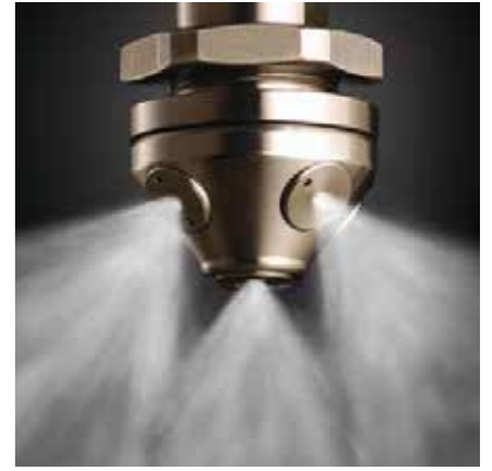
WATER SPRAY / MIST